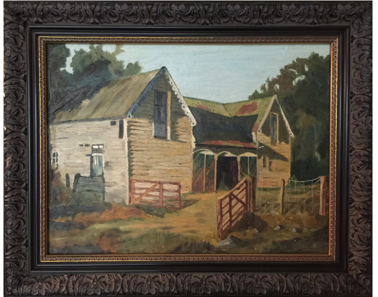
Derek Thresh's painting of "The Stables" on Zandes Farm, the site of today's Bucket Tree Motel.