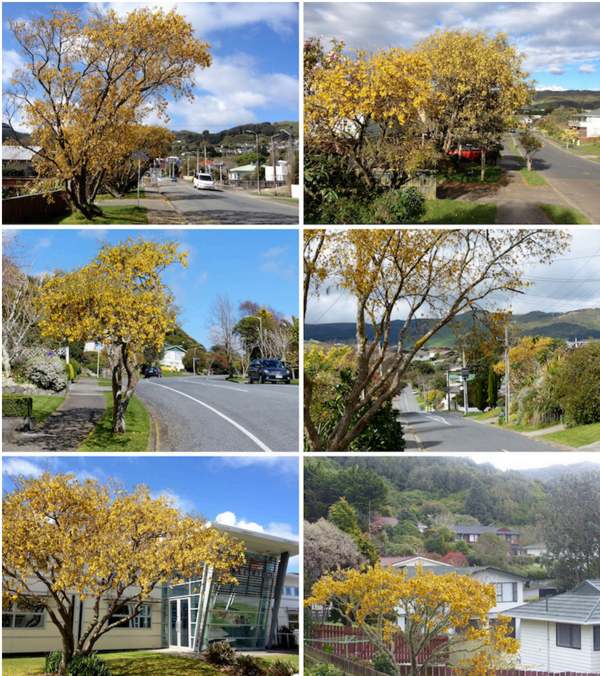
Clockwise from top left: • McLellan St • Peterhouse St • Larsen Cres • view from my lounge window (notice tui on top of tree) • Tawa College • Woodman Drive (north)