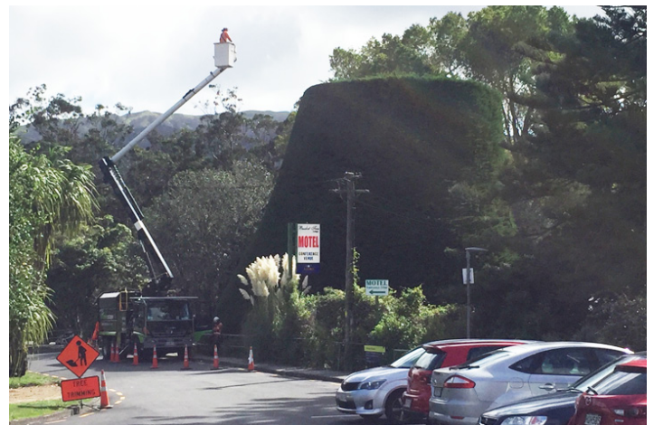
Right: Time for a trim