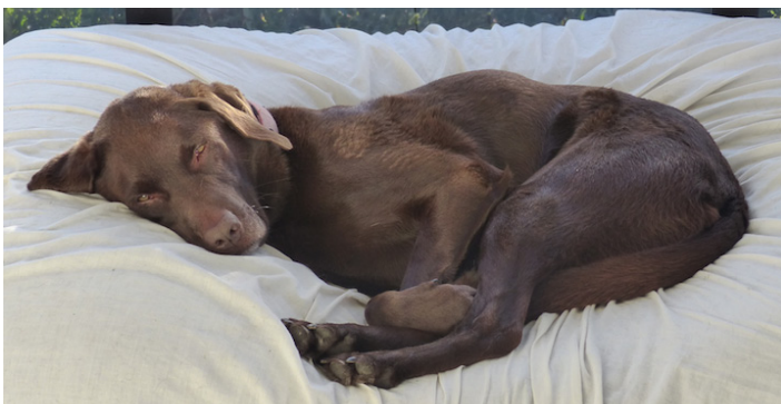
Above: It's a dog's life!

See www.tawalink.com/newsletters.html for back issues of the newsletter.