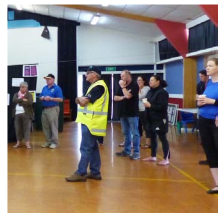
Listening to an emergency planning presentation