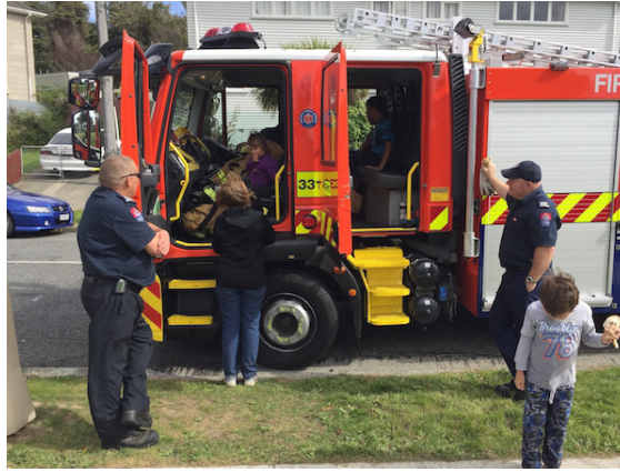
Time to check out the fire engine once the water action is over.