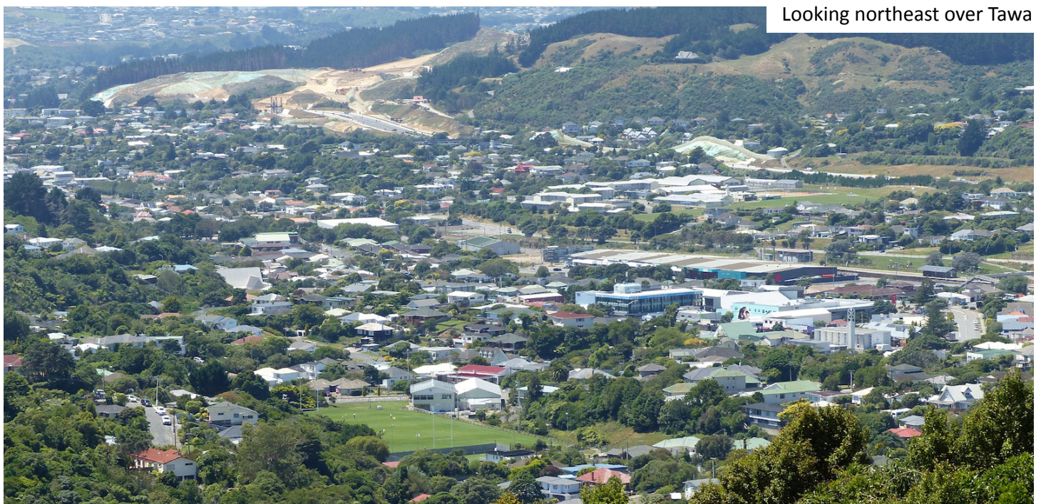
Looking northeast over Tawa