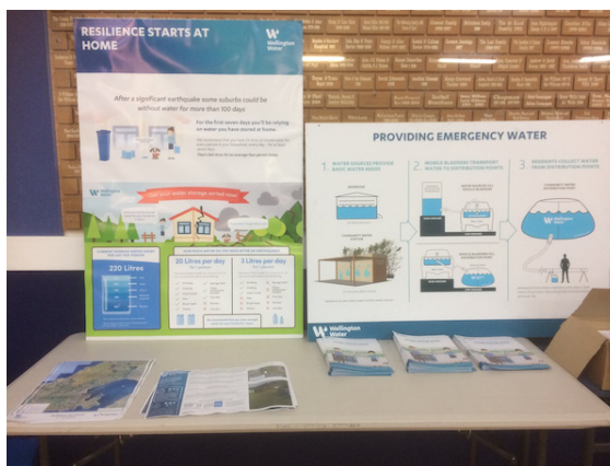
“Resilience starts at home”