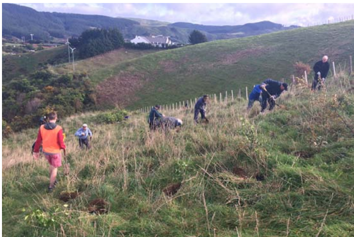
Port Nicholson Rotary volunteers

This new track enables the public to walk from the main entrance of Wilf Mexted Reserve at the junction of Collins Ave and Woodman Drive up through mature bush and emerge on Bing Lucas Drive. With a further walk of 500m south down Bing Lucas Drive, people can enter Woodburn Reserve next to 160 Bing Lucas Drive.