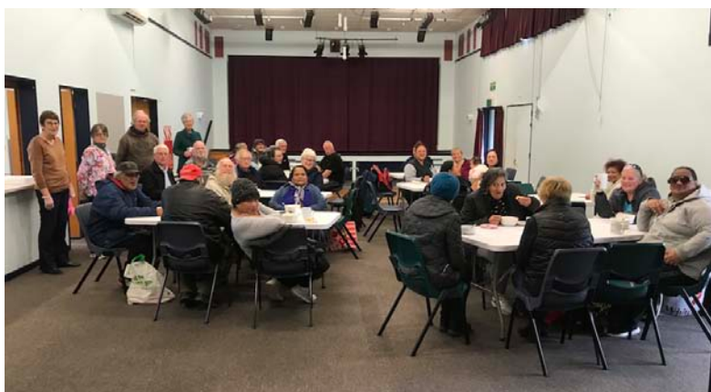
Enjoying hot soup and buns