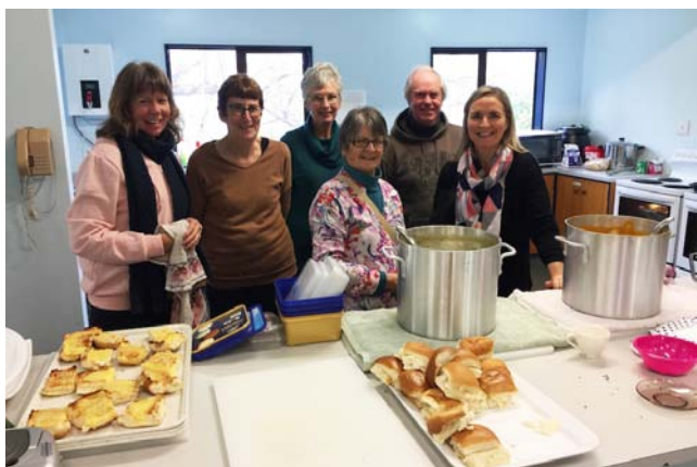
Great team of volunteers

For more about the Linden Social Centre, see https://wellington.govt.nz/services/community-and-culture/community-centres/locations/linden-social-centre