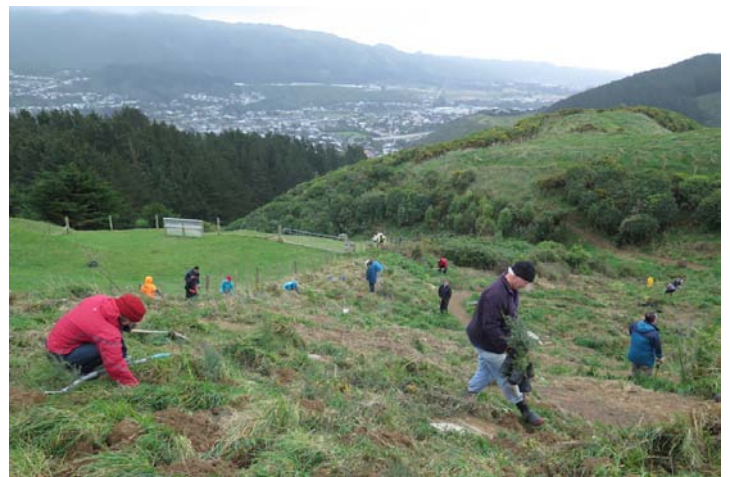
Bing Lucas connector track