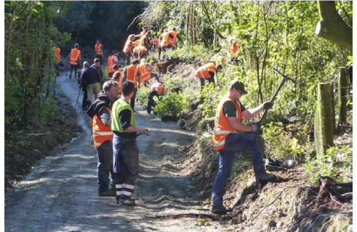
WCC Parks and Reserves team