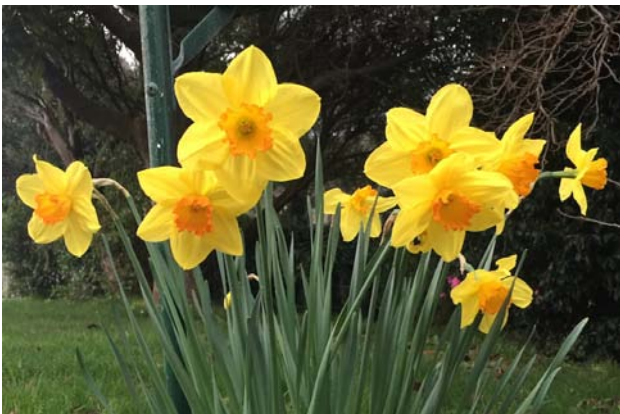
Spring is in the air!

If you no longer wish to receive the newsletter, please send us an email requesting your name be deleted from our list.