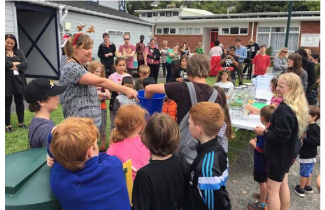
Big turnout for the community Christmas BBQ at the Linden Social Centre on Friday 21 December

This will also be a very good opportunity for you to meet and engage with residents and other stakeholders associated with Linden. And, where appropriate, you will be able to make any community initiatives and upcoming work known to residents keen to know more!