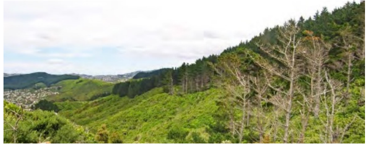
View from near Chastudon Place over Tawa's western hills

On the WCC website: "The Outer Green Belt is a series of reserves on the edge of the city that stretch from the Porirua City boundary to the south coast [of Wellington]. It covers more than 3,000 hectares and comprises over half of the City's public reserves network." This includes Spicer Forest and Te Ngahere-o-Tawa (formerly Forest of Tane) on Tawa's western hills.