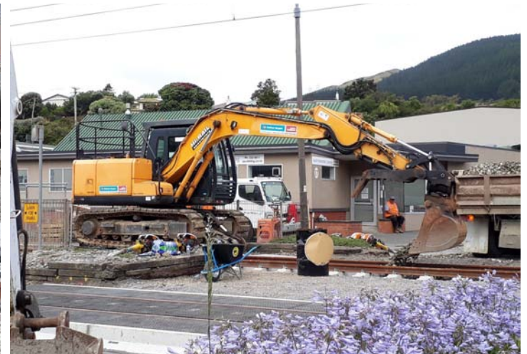
Work at the end of last year on the Linden railway crossing.