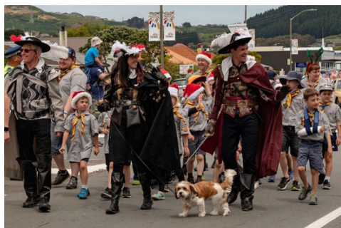
2018 Tawa Christmas Parade Photos courtesy of Kevin Walker, ZAPDOG PHOTOGRAPHY